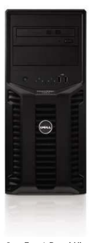
Figure 2. Front-Panel View

Figure 2 shows the front-panel view of the PowerEdge T110 II.