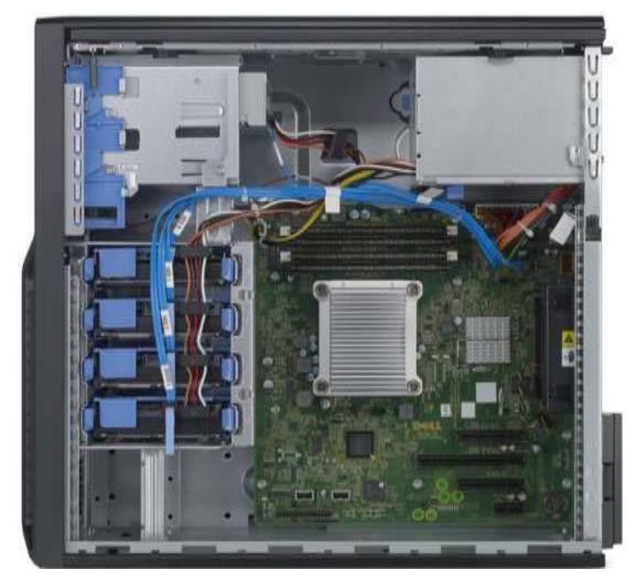
Figure 4. Internal-Chassis View

Figure 4 shows the internal-chassis view of the PowerEdge T110 II.