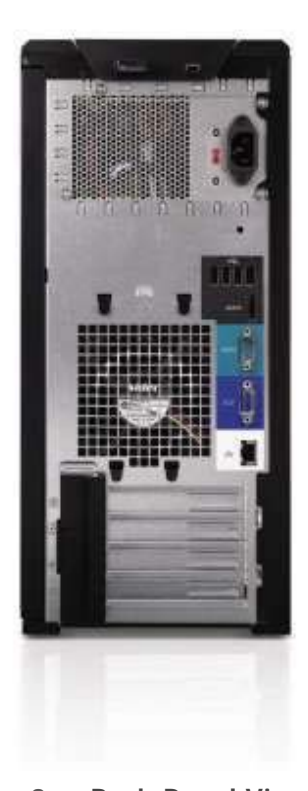
Figure 3. Back-Panel View

Figure 3 shows the back-panel view of the PowerEdge T110 II.